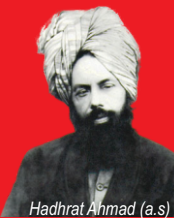
Hadhrat Ahmad (a.s.)

The objective of the Movement is to educate the world about Islam, to promote understanding between people of different religions and to bring harmony among the people of the world by bringing them closer to God.