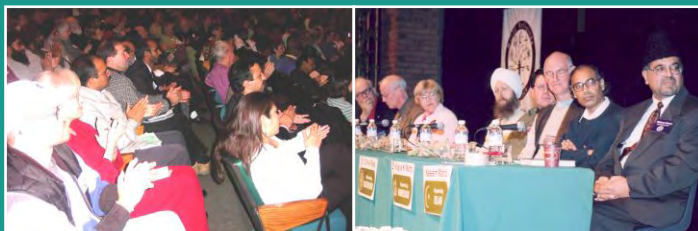
October 4, 2003: In Search of the Existence of God - University of Waterloo Speakers representing various faiths at the Questions Session