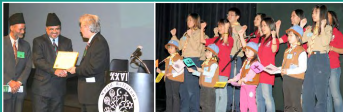
December 2, 2006: My Faith and Freedom of Conscience - Waterloo Hon. Mike Colle, Ontario Minister of Citizenship presenting recognition