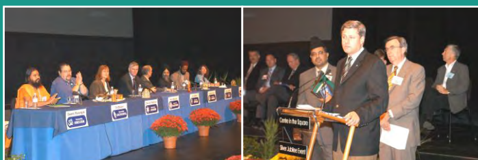
October 1, 2005: Basis and Concept of Salvation - Kitchener Rt. Hon. Stephen Harper addressing the opening ceremony