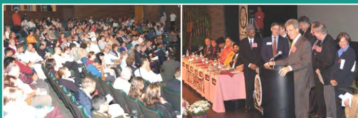
October 2, 2004: Why Religion? - University of Waterloo, Ontario Hon. Joe Volpe (Minister of Citizenship) addressing the opening ceremony